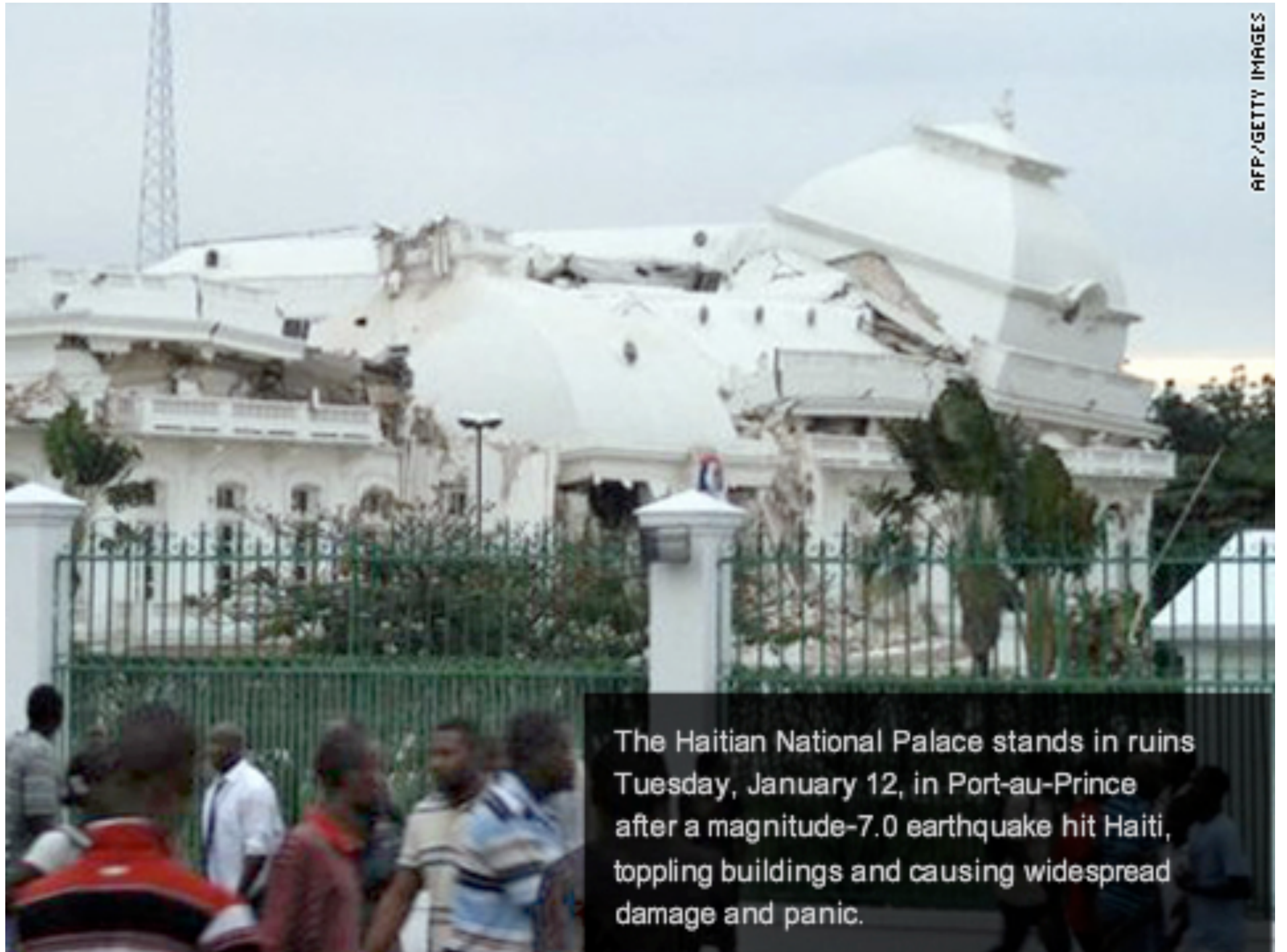
The Haitian National Palace stands in ruins Tuesday, January 12, in Port-au-Prince after a magnitude-7.0 earthquake hit Haiti, toppling buildings and causing widespread damage and panic.